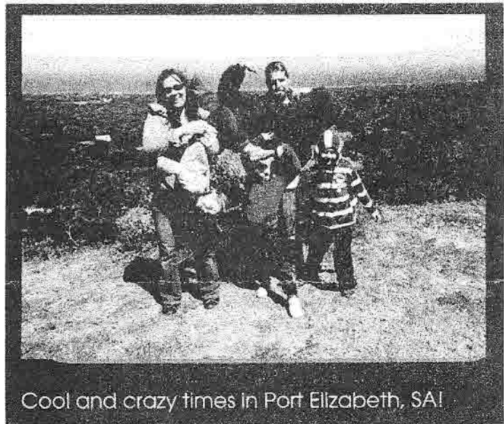
Cool and crazy times in Port Elizabeth, SA!

Thanks for your support this past year and for helping us make a difference in Lesotho.